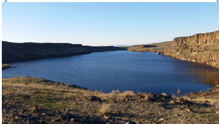
While it was snowing and freezing here, this was Heart Lake near Othello.