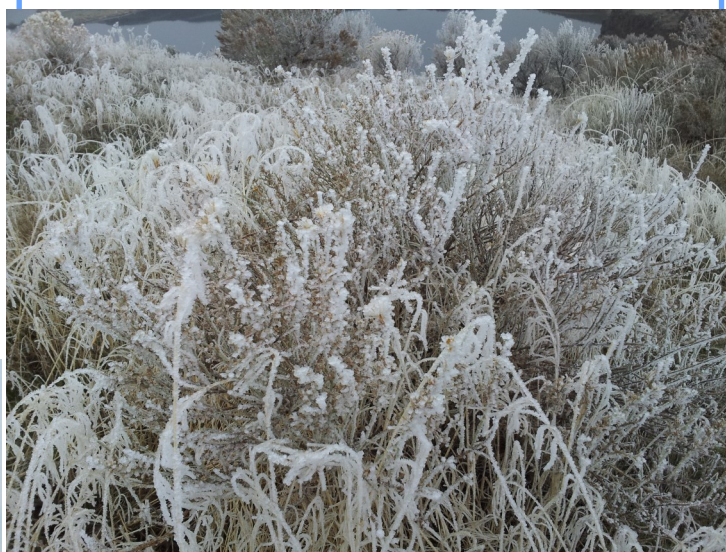
Same time of year last year in Columbia National Wild life Refuge.

I know these aren't boating pictures, but they represent a part of our state that some folks may not see much. See one boating picture to left. Autumn scene of Baker from our boat near Sinclair Island.