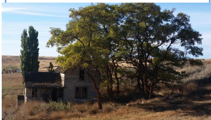
Love these abandoned homesteads. October near Bridgeport.