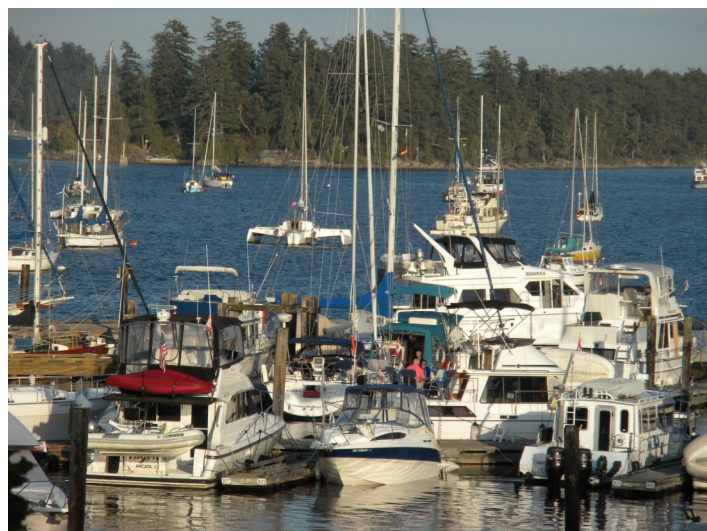
Squadron boats in busy Ganges Harbor on Salt Spring Island, B.C.