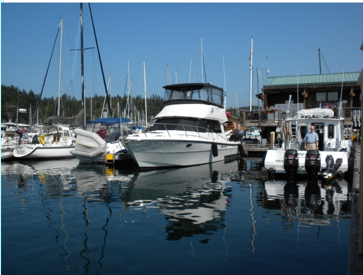
Poet's Cove Resort, S. Pender Island, B.C.

Boats at Deer harbor. Quiet Time, Fish N Chicks, Angelina and Time Flies