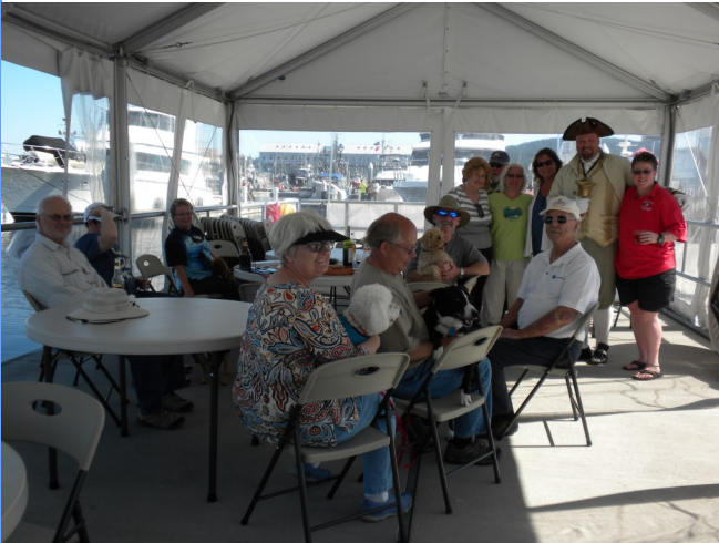
Anacortes Waterfront Fest Happy Hour with Town Crier