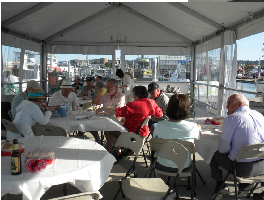
Potluck on the party float