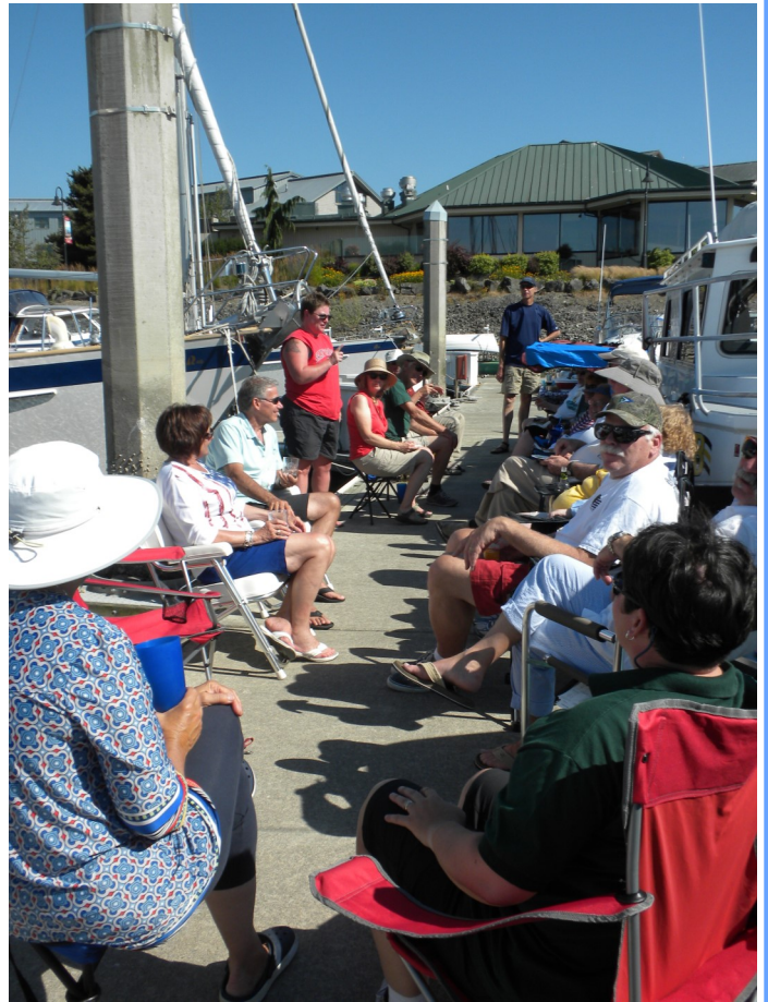
The Gang eating on the dock (What else does this bunch do?)