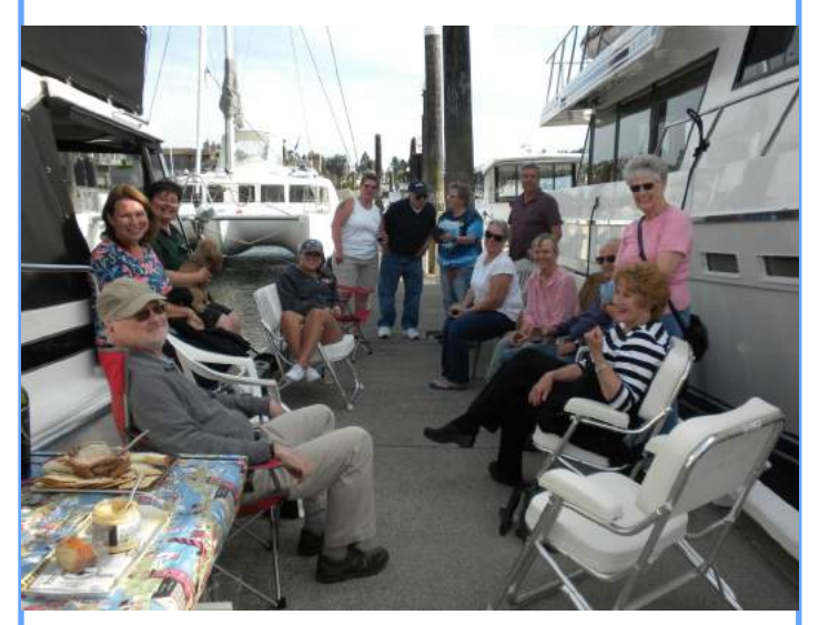
Happy hour on the Visitor's Dock