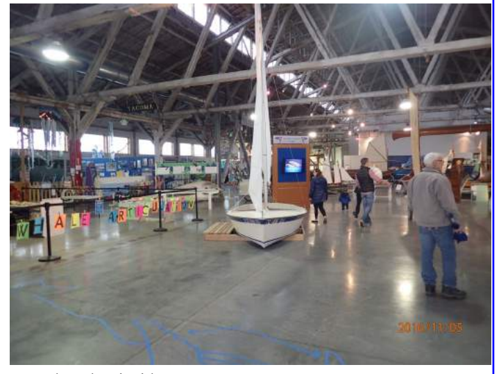
Another shot inside museum.

It was a soaking wet day and we were all drowned rats as we had to walk about 3/4 mile in the rain to the bus back to the train station but it was a wonderful time anyway.