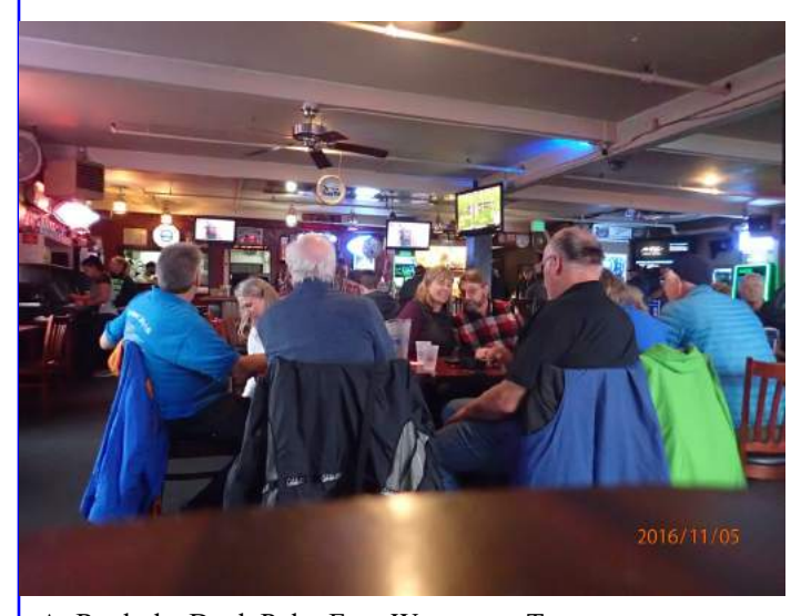
At Rock the Dock Pub . Foss Waterway, Tacoma