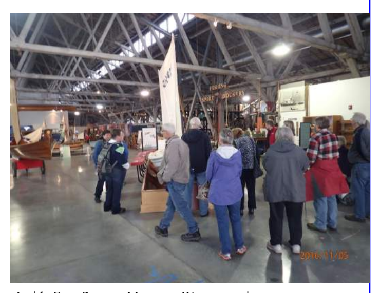
Inside Foss Seaport Museum. We got a private tour.