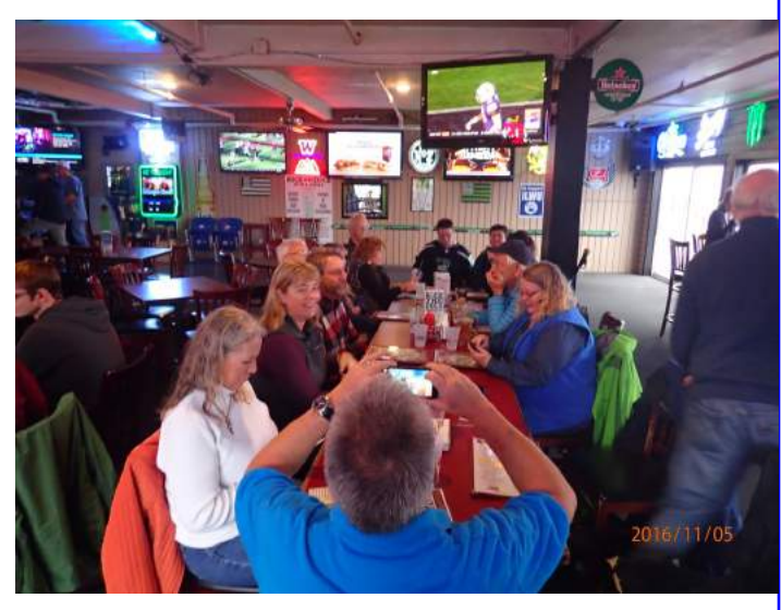
More of happy group drying off at Rock the Dock