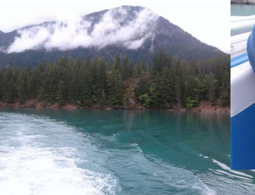
Photos from Diablo Lake and Lunch Cruise. LtoR: Ranger explaining inner workings of the Diablo Dam; Bridge road to area off Hwy 20; Mountain view; and Deanna Randall-Secret with local rock