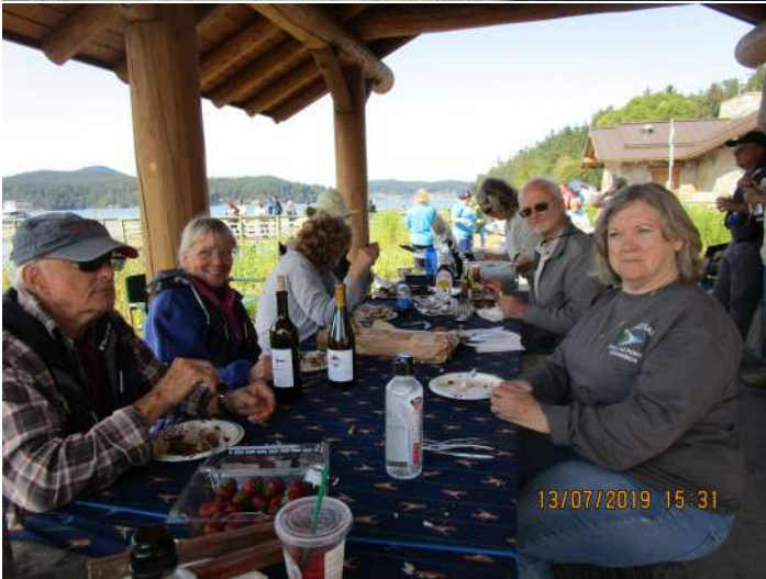
The gang and the crab feast at Coronet Bay. There were even left overs. Crabbing was great right near the dock. 4 Boats showed up. 5 if you count the trailer dingys.