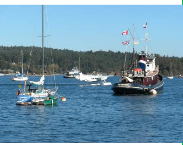
Assorted Boats in Ganges Harbor Aug 2015

Prima Bistro April 6, 2019 Mariner's Game August 25, 2019