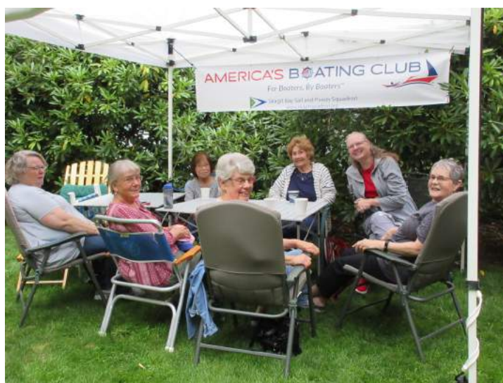
The ladies chatting under the awning