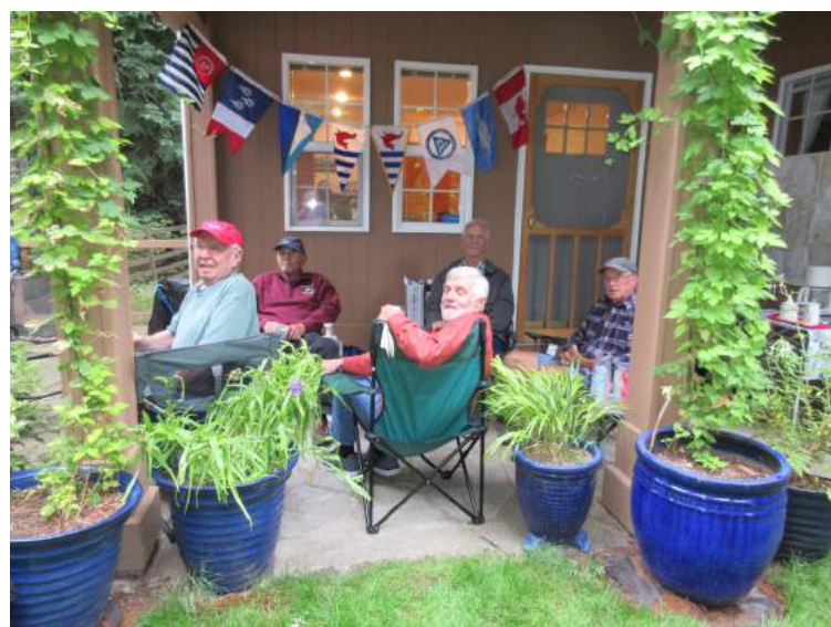
The guys chatting on the patio