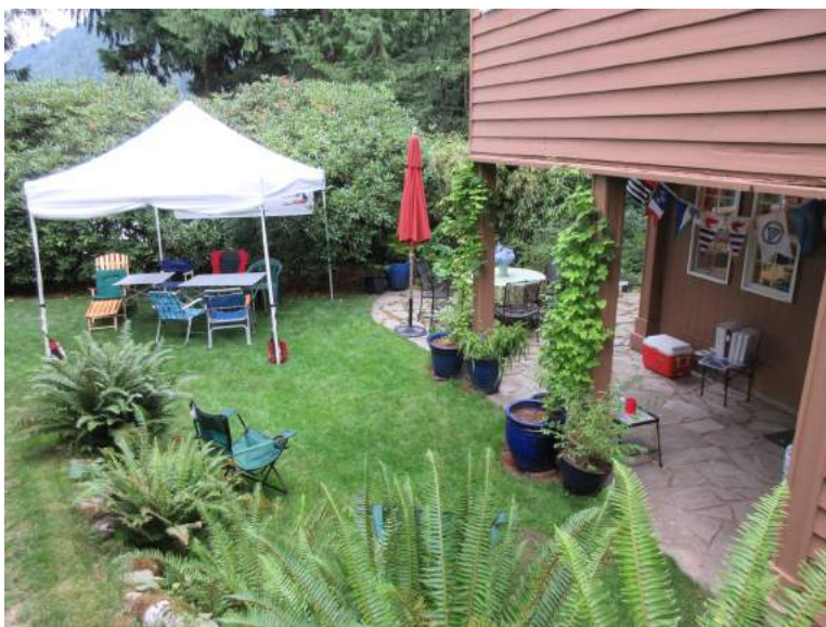
Ready to rendezvous