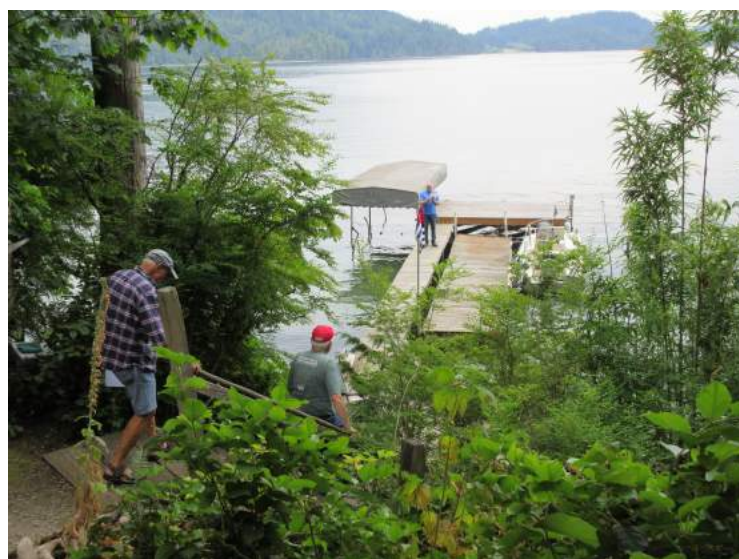
Scavenger hunt time