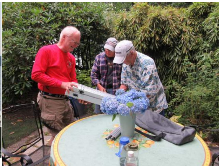
How many guys does it take to disassemble a folding table?!