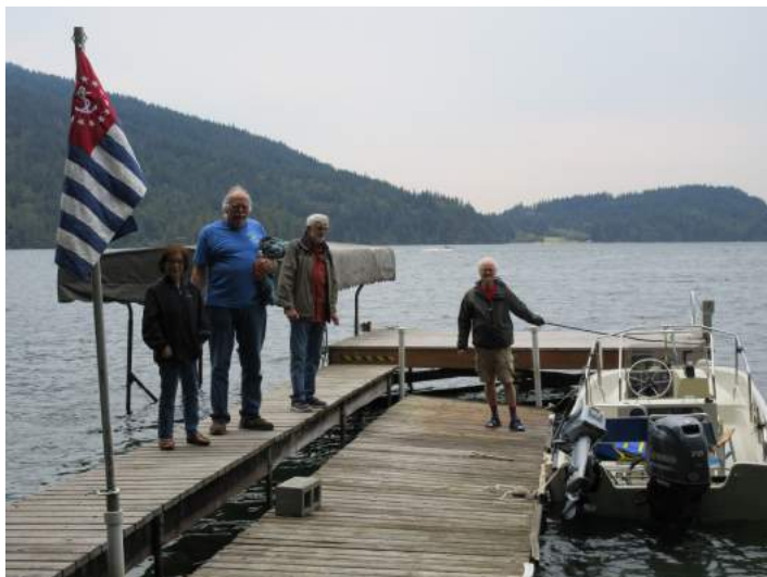
Heading out to do lake tours on Wow Whee