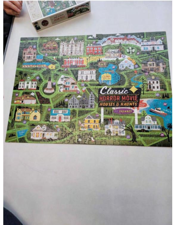
Jigsaw on ferry on way home