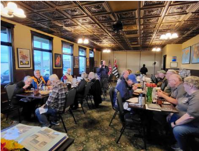
Donna, our regular picture taker that never gets in pictures